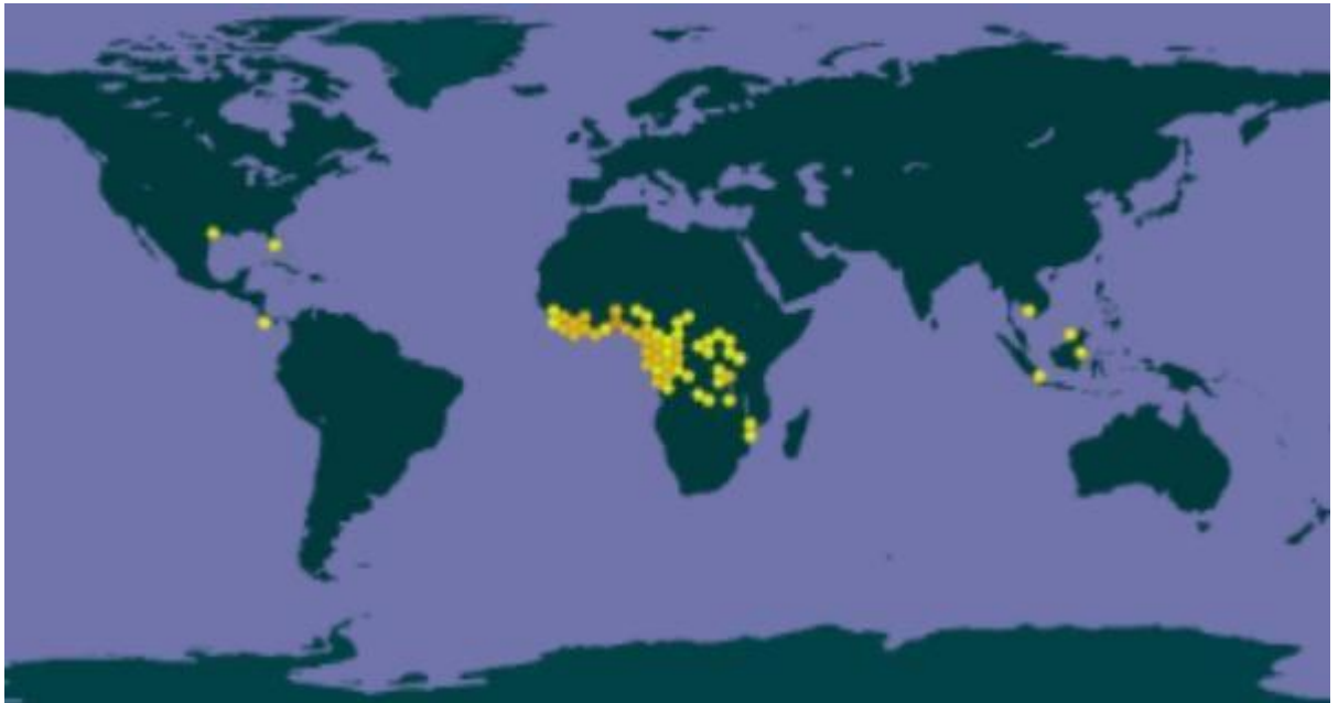
Figure 4. Distribution map of C. ficifolia (GBIF.org, 2022)

The distribution maps of C. ficifolia and U. lobata based on georeferenced occurrences from GBIF.org database are illustrated in figures 4 and 5, respectively.