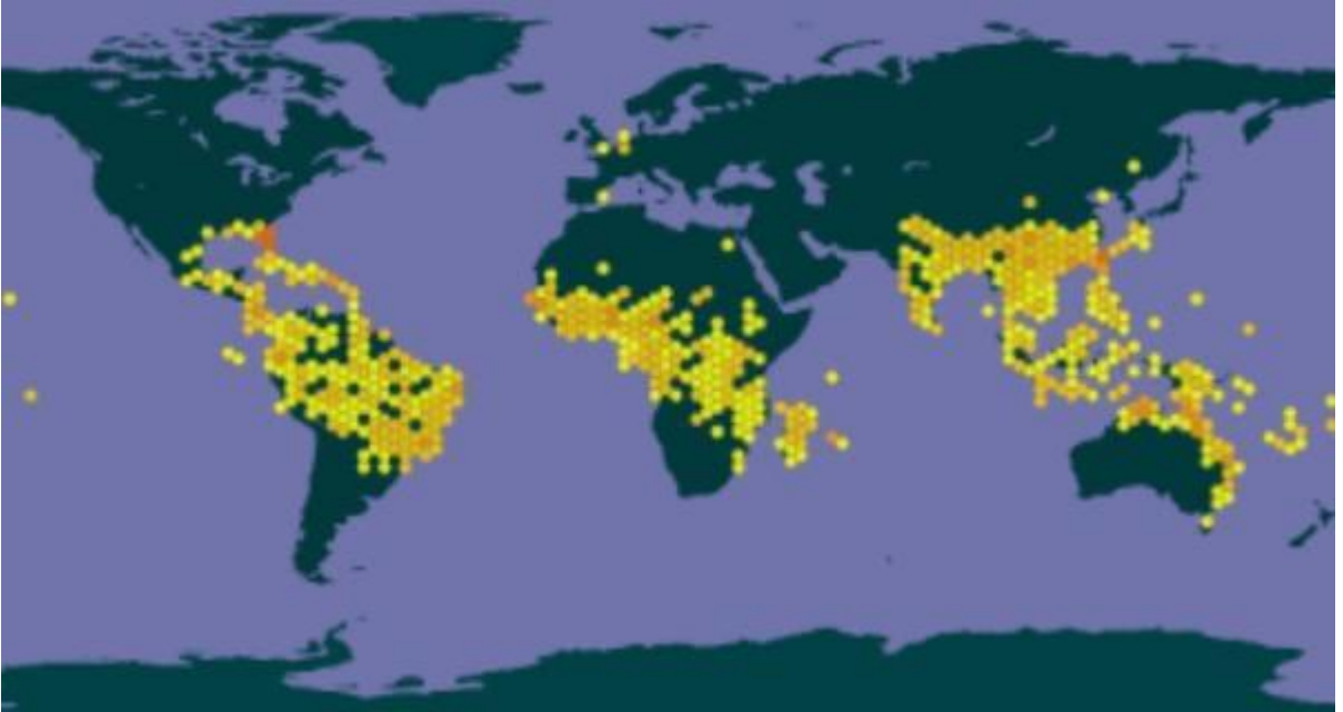
Figure 5. Distribution map of U. lobata (GBIF.org, 2022)