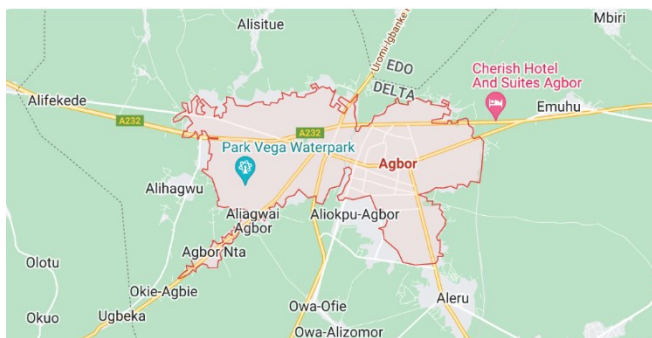
Map of Agbor

Ozanagog is located in Agbor/Ika South Local Government Area of Delta State with GPS coordinates of 6^{\circ} 15' 50.73120\text{N} and 6^{\circ} 12' 06.7788^{\circ}\text{E} . Zanagogo is 6^{\circ} 8' 1-6^{\circ} 10\text{N} Latitude and Longitude 6^{\circ} 6' 1-6^{\circ} 17^{\circ}\text{E} .