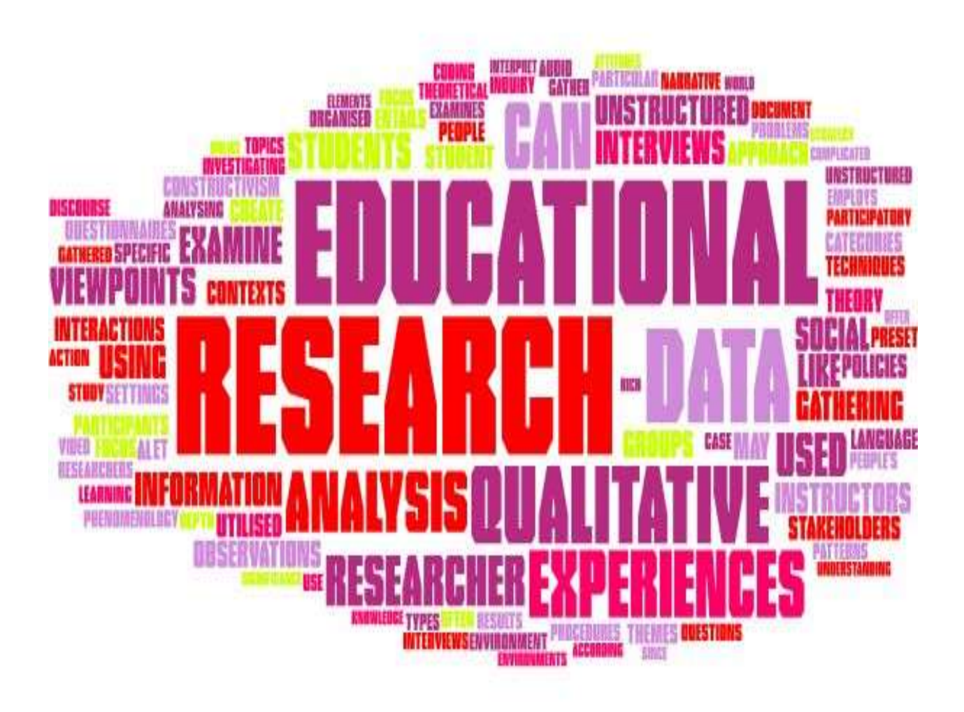
Figure 1: Word Cloud of the concept discussed in this paper

approach to qualitative research in educational contexts. The main concepts discussed in this paper are captured in the word cloud shown in Figure 1